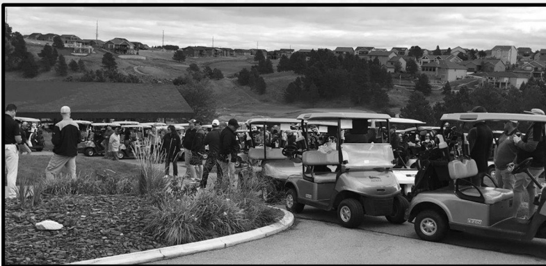
The golfers get ready to take off!